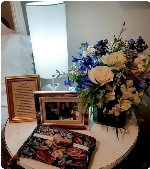
Happy's Mom's Day. Missing you.